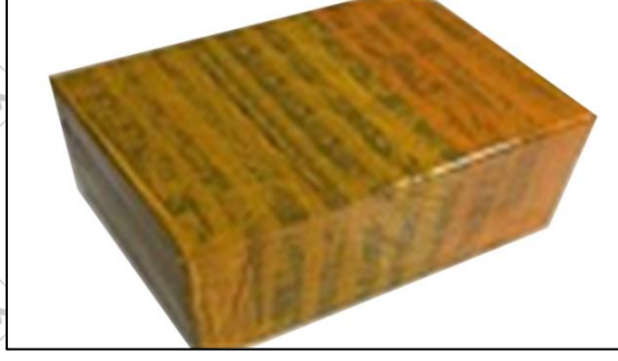
Pic No.3 International express packaging: Wrapped with yellow tape after wrapping black protective film