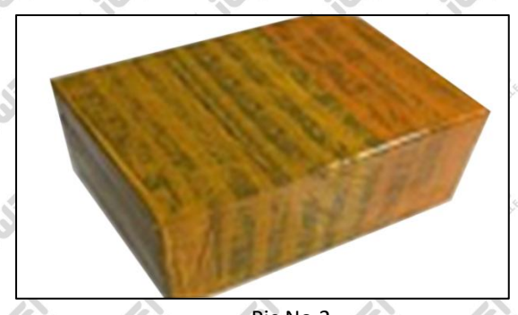
Pic No.2 International express packaging: Wrapped with yellow tape after wrapping black protective film