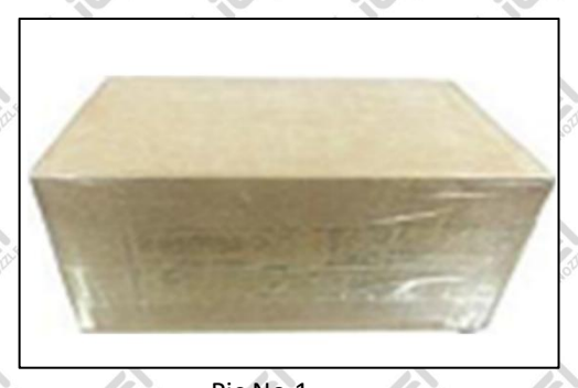
Pic No.1 Domestic express packaging: Wrapped by Transparent tape

Minors are prohibited from using transparent tape, yellow tape, black wrapping protective film, and white wrapping protective film to avoid personal injury.