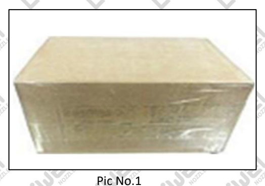
Domestic express packaging: Wrapped by Transparent tape

Minors are prohibited from using transparent tape, yellow tape, black wrapping protective film, and white wrapping protective film to avoid personal injury.