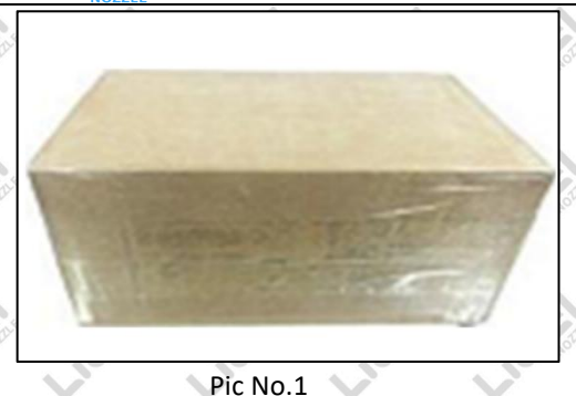
Domestic express packaging: Wrapped by Transparent tape