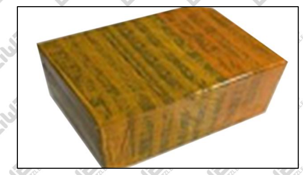
Pic No.2 International express packaging: Wrapped with yellow tape after wrapping black protective film

Pic No.1 Domestic express packaging: Wrapped by Transparent tape