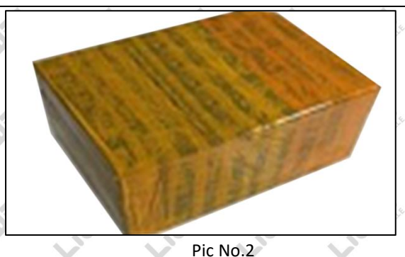
International express packaging: Wrapped with yellow tape after wrapping black protective film