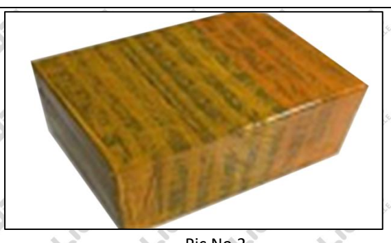
Pic No.2 International express packaging: Wrapped with yellow tape after wrapping black protective film