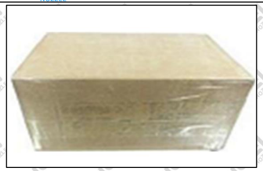
Pic No.1 Domestic express packaging: Wrapped by Transparent tape