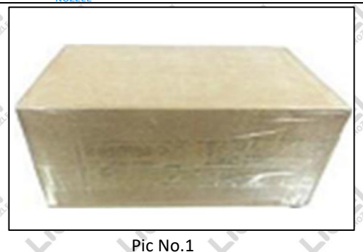
Domestic express packaging: Wrapped by Transparent tape